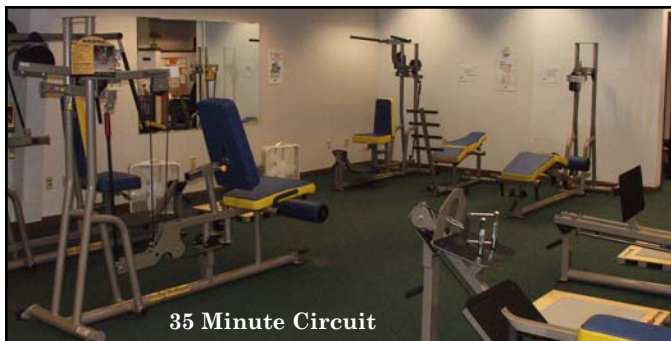
35 Minute Circuit

What makes Community Resource Total Health & Fitness different from other health clubs? They provide complete services for people seeking better health for spirit, mind and body. They not only address physical health, but emotional and spiritual as well. As three part beings, people need to address all three parts in order to truly become healthy and whole. Plus, Community Resource Total Health & Fitness is a lot of fun!